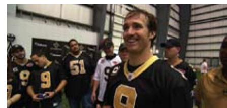
WANT TO HANG OUT WITH THE BEST FRANCHISE IN SPORTS? GO TO ESPN.COM AND SEARCH: SAINTS MAG VIDEO